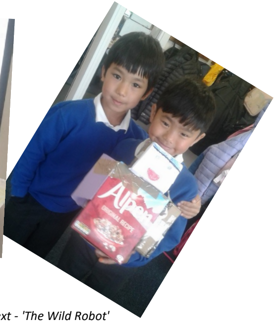
'In year 4 we have been exploring our new text - 'The Wild Robot' and have designed and built our own robots which interesting features to ensure they can survive the wilderness!